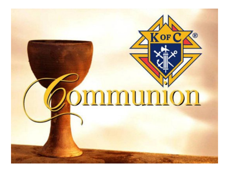
Mark Sunday, October 13th, 2024 on your calendar for the Council's next Corporate Communion Mass and Breakfast.