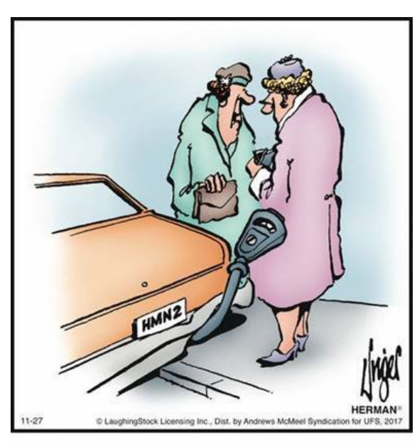
"Maybe we should park somewhere else."