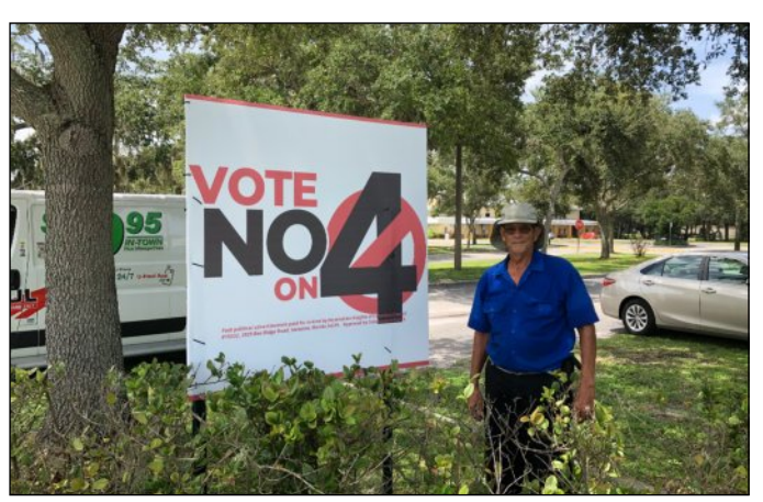
First 4 ft by 4 ft VNO4 sign installed at St Jude's