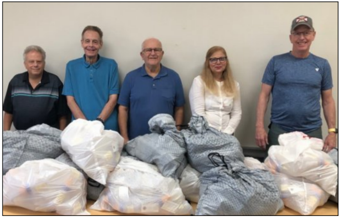
Volunteers at Baby Bottle Tagging Party

The annual Incarnation Baby Bottle Drive to support the operation and maintenance of the ultrasound machines at SMPC will take place in