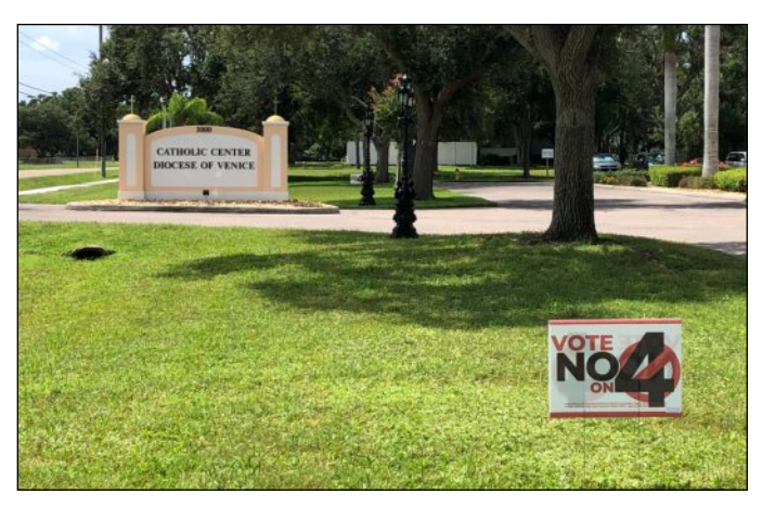
One of two Incarnation yard signs placed in front of the Catholic Center in Venice