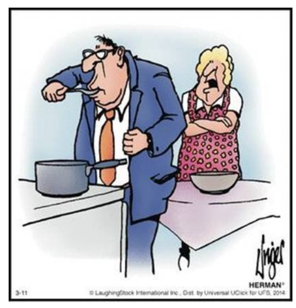
"I hope it tastes good. It's for the cat."